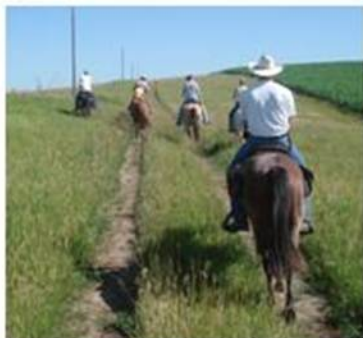
Several of the staff enjoying a trail ride on a quiet August day.

If you are a 3rd or 4th year veterinary student in good academic standing with an interest in rural or mixed animal practice, we invite you to come and learn with us. As a family run and owned veterinary business, we offer hands-on opportunities in equine, small & large animal care and an in-depth look at practice management. However, more than that, we offer a realistic view of what it truly is to live your work, love your job, value your ability & enjoy your life.