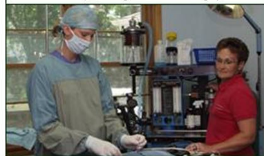
Dr. Erin performing a small animal surgery

-A furnished, newly remodeled 2 bedroom house will be provided. Students will need a cell phone, vehicle, money for food (a grocery store is 3 blocks away) and a willing positive attitude.