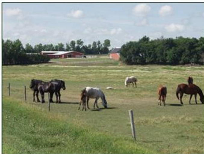
Broodmares relaxing at Haymaker Farm, where the equine hospital, breeding facility and equestrian center are located.