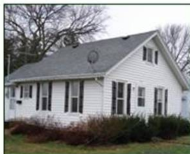
Housing is provided in a newly remodeled 2 bedroom house complete with laundry and full kitchen. (Students will need a vehicle & a cell phone.)

*Work with numerous different species, with different types of owners, that will challenge your knowledge, your ability to think outside the box and above all, to provide the best care possible for your patient.